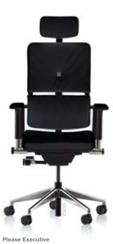
Upholstered in stitched leather, featuring a 2D headrest and 3D armrests